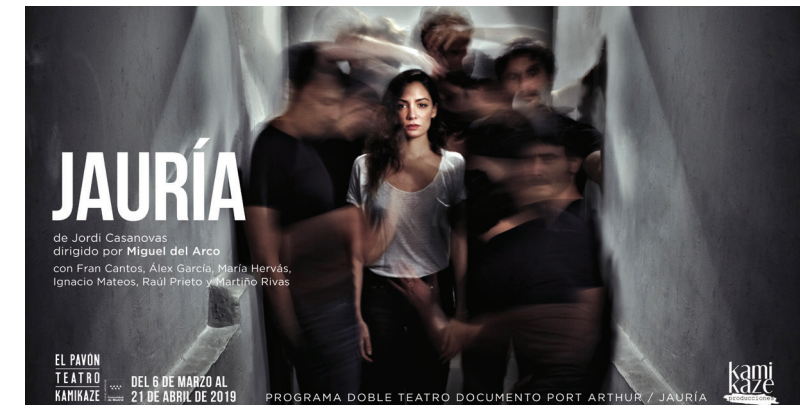
The poster for Jauría's 2019 run.

The case that Jauría is based on, which led to the revision of the criminal code in Spain, offers one example, at least, of the law's capacity for self-correction when confronted with a judgement that despite applying the principle of legality was found to be in delicto – guilty of committing a transgression. 12 But the play also exemplifies, as does The Bread and the Salt , how theatre can constitute itself as a site, a place – and, above all, as a political space – in which the gap between legal theory and practice can be staged in the form of an interrogation of the law and its problematization by the incalculable demand of justice.